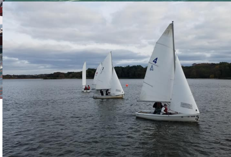
2019 Spring Sailing season, various photos, various teams!