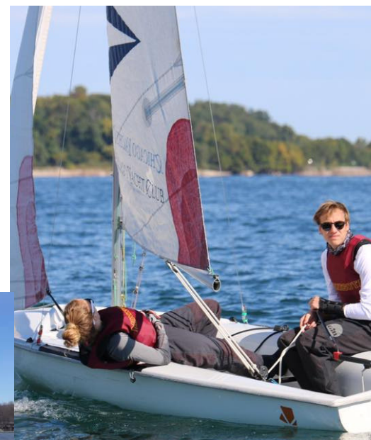
(Above) Sailors at the 2019 Pere Marquette Regatta. (Right) Sailors at the team race national qualifier hosted by Michigan!