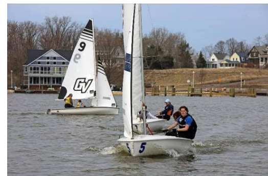
Fast cold weather sailing at the 2019 Laker Showdown!

-Stay hydrated! The more water you have in your system, the better you are able to retain heat! Research done by SJSU for NASA found that caffeine lowers the temperature of the body so stick to herbal teas or other hot drinks low in caffeine to keep your sailors warm during rotations!